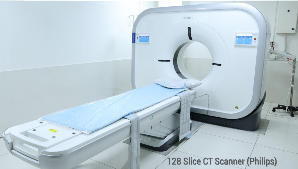
128 Slice CT Scanner (Philips)

A high calcium score indicates a moderate to high risk of an adverse event due to heart disease in the next 5 years.