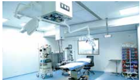
State of the art Operation Theatres