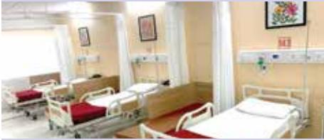
Semi Special Room