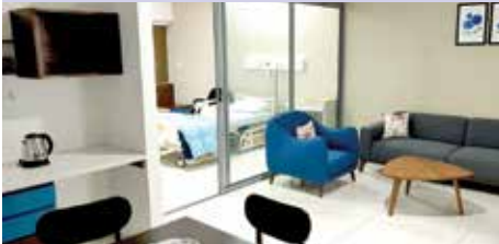
Premium Suite Rooms