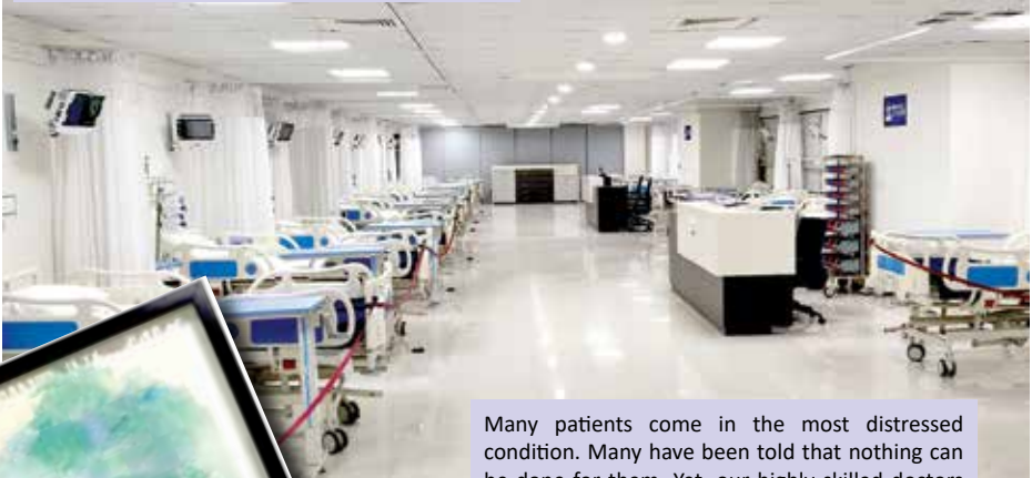
Intensive Care Unit [ICU]